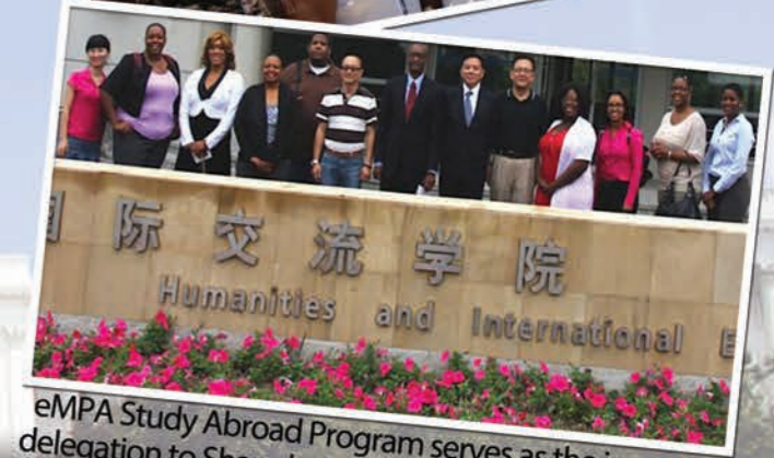
eMPA Study Abroad Program travels to Brazil. eMPA Study Abroad Program serves as the inaugural delegation to Shanghai Second Polytechnic University.